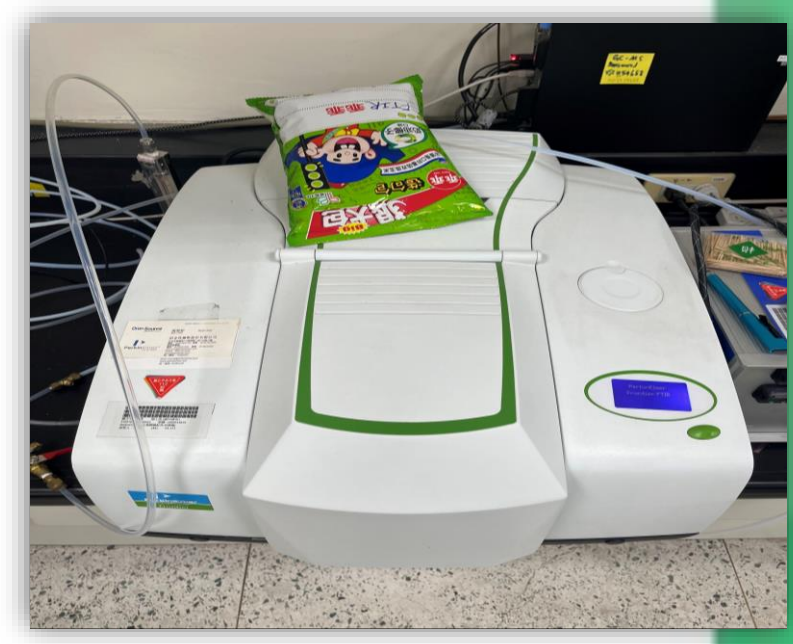
Fourier-transform infrared spectroscopy